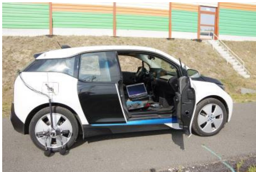
Fig. 2. OBSIe measurement set installed on EV, BMW i3

The measuring set is mounted onto an EV, HEV or FCEV of which the plug-in HEV (PHEV) type would be most convenient or practical. Since EVs have only limited range to approximately 120 km in order to perform continuous measurements it needs to be transported by a car carrier. HEV's or PHEV's are able to drive in pure electric mode and if it can be activated by the driver, it would be a very convenient solution for carrying the OBSIe set (see Fig. 2).