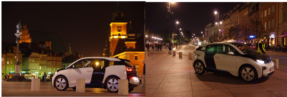
Fig. 3. Downtown Warsaw Noise Measurements with OBSIe

First tests of the OBSIe system were performed in real traffic conditions on several road test sections. These were asphalt and cement concrete wearing courses paved on roads located in Poland (motorway, rural and urban scenarios were tested). One of the test sites chosen was a stone paving brick on Krakowskie Przedmieście in old town Warsaw (see Fig. 3).