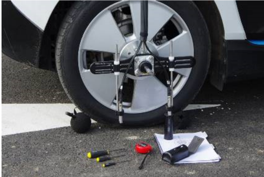
Fig. 1. Sound intensity probes mounted on wheel hub, calibration process in progress

The measuring set is mounted onto an EV, HEV or FCEV of which the plug-in HEV (PHEV) type would be most convenient or practical. Since EVs have only limited range to approximately 120 km in order to perform continuous measurements it needs to be transported by a car carrier. HEV's or PHEV's are able to drive in pure electric mode and if it can be activated by the driver, it would be a very convenient solution for carrying the OBSIe set (see Fig. 2).